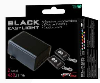
Packaging 15 x 25 x 7 cms