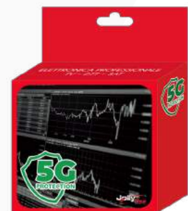
Packaging 13 x 14 x 5 cms